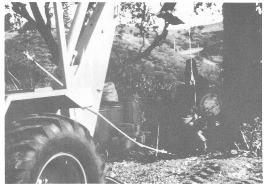
FIG. 1-The decedent in Case 1.

The victim had used the ligature attached to the hydraulic shovel to achieve partial autoerotic asphyxiation, and it was hypothesized that he lost consciousness and acciden-